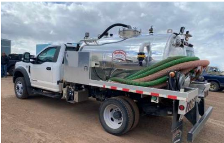
Yuwehloo Pahki was able to complete a business plan for the operation of a pumper truck and then utilized CARES Act funding to purchase it.

community created through the Navajo–Hopi land dispute resolution and long awaiting promised economic opportunity.