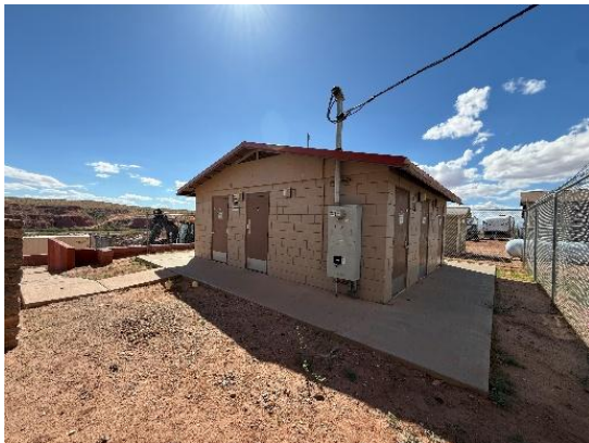
Existing bath house at the Village of Moencopi (Lower).

The Village of Moencopi (Lower) is advancing a critical community health initiative to repair or replace its existing bath house, a facility that provides essential bathing services for residents. Recognizing the importance of maintaining and modernizing this infrastructure, Village leadership initiated planning to pursue funding through the Hopi Abandoned Mine Lands (AML) and Abandoned Mine Land Economic Revitalization (AMLER) programs.