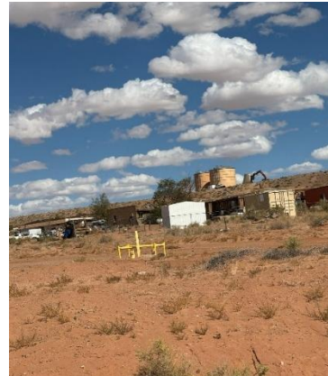
Demolition work on old water tank at Moenkopi in 2025.

The Moenkopi Utility Authority (MUA), with strong support from JVSP and Building Communities, secured a $1.5 million Congressionally Directed Spending (CDS) award to advance critical water infrastructure improvements for the community. The funding supports the Pasture Canyon Water Development Project, which includes construction of a transmission line with tunneling beneath the highway, a new pump house, installation of a SCADA control system, security fencing, and a 230,000-gallon fiberglass storage tank.