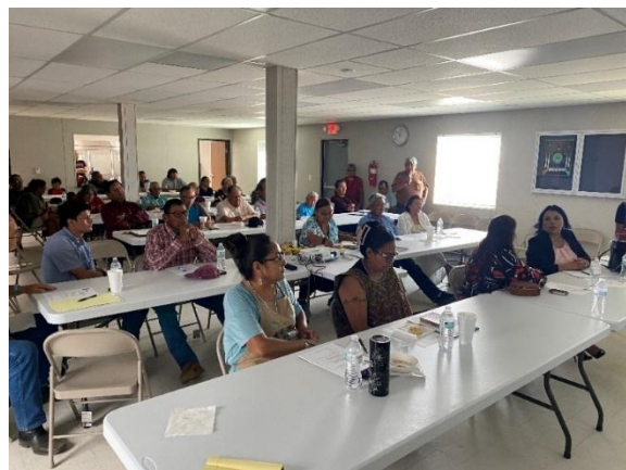
Participants from three Tribes hosted by Yuwehloo Pahki in July 2024.

JVSP continued to foster regional collaboration by hosting a July 2024 grassroots meeting at Yuwehloo Pahki Community, bringing together leaders and advocates from the Hopi Tribe, Navajo Nation, and San Juan Southern Paiute Tribe. This gathering—one of five in-person convenings over three years—highlighted shared priorities related to the Bennett Freeze and Forced Relocation and showcased each Tribe’s progress in planning and project development.