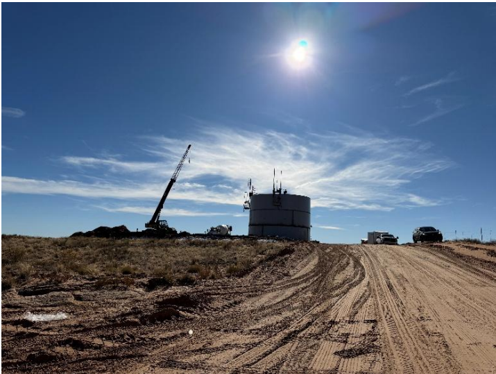
Construction of the new water storage tank at Side Rock (December 2025).

As part of its $86.2 million American Rescue Plan Act allocation, the Hopi Tribe dedicated $25 million to construct a major water transmission line from the Side Rock Well fields to Moenkopi along an existing right-of-way. This investment represents one of the largest single water-infrastructure commitments ever made by the Tribe and will also support future service to Poosiwlenena, the planned community development for the Village of Moenkopi (Lower).